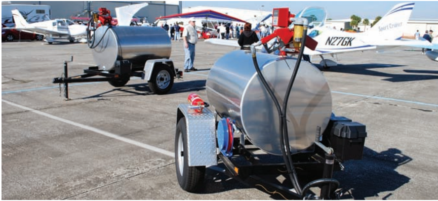
At this year's U.S. Sport Aviation Expo at Sebring, Florida, Jet Fleet Management (Fort Lauderdale, Florida, http://JetFleetMgmt.com ) displayed 150-, 280-, and 500-gallon capacity fuel trailers aimed at those who burn autogas.

in 1932 and successfully powered a number of airplanes and Zeppelins. An interesting related development is NATO's "one fuel" policy, aimed at eliminating 100LL and autogas from the battlefield. This policy is putting pressure on the suppliers of spark-ignition unmanned aerial vehicle engines to operate on diesel or JP-5/8 only. Some of this technology is finding its way into the LSA community as will be described in Part II of this article. In many parts of the world, for instance on the African continent, Jet A is the only aviation-grade fuel found at airports, as related to the author by missionary pilots recently returning from central Africa. Clearly, there are multiple reasons for engine manufacturers to consider the use of heavy fuels today.