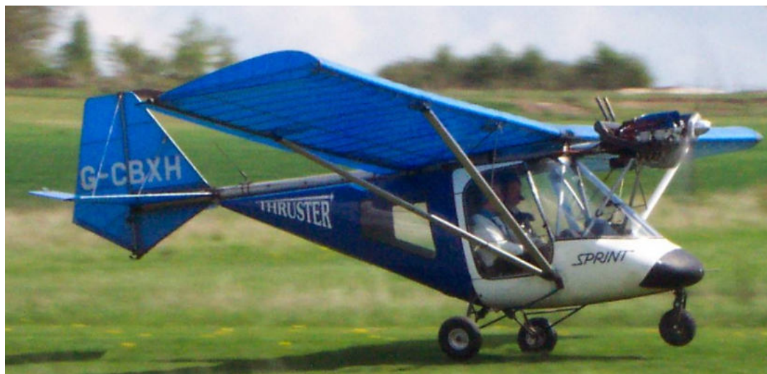
Figure 8 Thruster T600N Sprint

A most recent, but slightly indirect evolution of the fuse-tube concept is the Ikarus C42, developed by German company COMCO IKARUS. Superficially, it is a very different aeroplane; however, if disassembled the aircraft retains the original Weedhopper concept of the fuse-tube mounting the engine and horizontal stabiliser; the wing is also substantially similar to that of the Thruster with straight leading and trailing edge tubes, and a fabric covering shaped with aluminium alloy battens. The primary differences are that the fuselage tube is now lower in the aeroplane – putting the powerplane and tail closer to the aircraft's vertical centre, and changing the attachments of the cockpit structure to the fuse-tube. The aerodynamic shape, like that of the Thruster Sprint consists of lightweight composite panels clipped to the structure and carrying no main load paths.