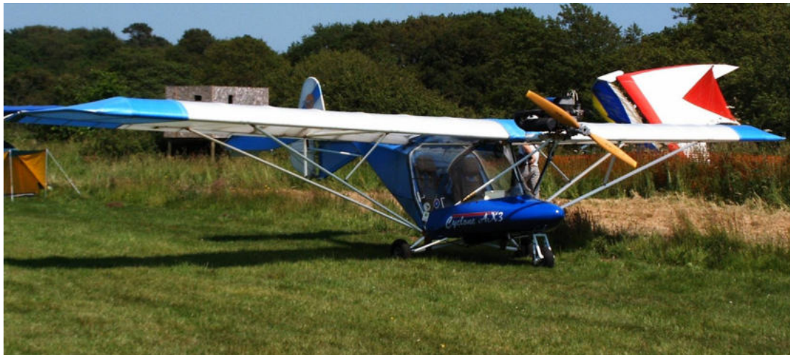
Figure 2 Cyclone AX3

stroke engines, originally developed for applications such as snowmobiles, but increasingly popular on microlight aeroplanes. Cyclone were also closely associated with weight-shift microlight manufacturer Solar Wings, who were developing expertise in meeting the newly introduced British certification requirements for microlight aeroplanes 3 . Despite these requirements being the most demanding in the world at that time, very few modifications were required to obtain UK certification in 1982. Sales of the AX3 were healthy, and a later development of the slightly heavier and more sophisticated AX2000, led by designer and test pilot Dr. WG “Billy” Brooks, continued this trend.