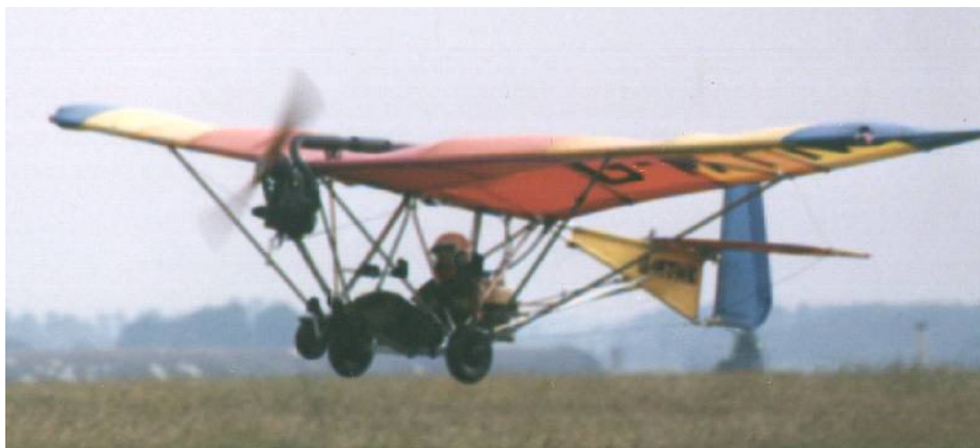
Figure 1 Chotia JC-24b Weedhopper

cruciform with the fin and rudder areas divided approximately 50/50 above and below the tailplane and elevator.