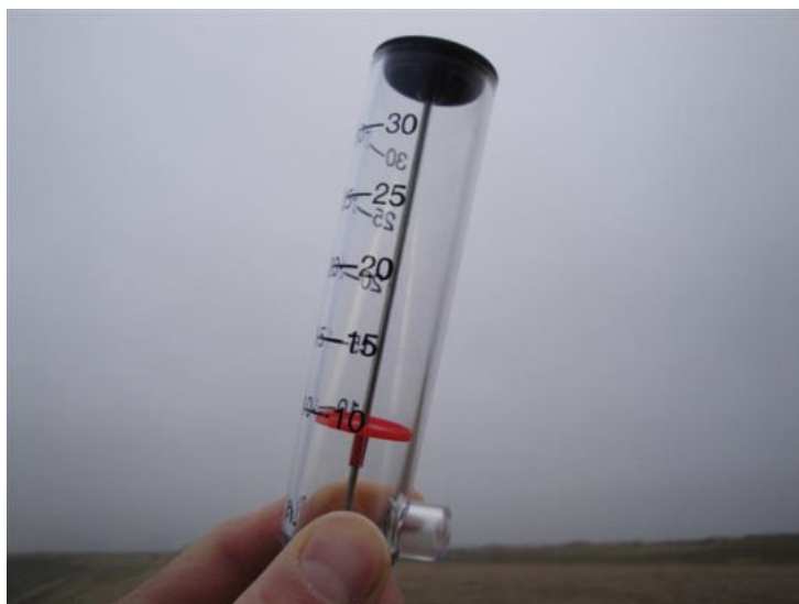
Figure 11 Hall Windmeter

The next aeroplane in the evolutionary scale which was exposed to formal assessment was the AX3, tested for UK Type Approval in 1984. Type Approval was a newer process requiring full compliance with the certification basis, manufacturer approval and a degree of manufacturing oversight. This was the fifth 3-axis microlight aeroplane type formally certified in Britain and whilst (perhaps because) the community was still early on its certification learning curve, the process was reasonably straightforward. At this time, the practices in microlight flight testing were very much in their infancy, and based upon a “tick box” approach relating directly, and solely, to compliance with the cardinal points of the certification standard. Against this standard – which particularly was based heavily upon subpart B of wider known civil standards such as FAR-23 13 , although not including spinning, the aeroplane was found to be satisfactory.