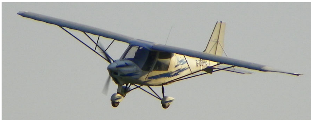
Figure 9 Ikarus C42

A most recent, but slightly indirect evolution of the fuse-tube concept is the Ikarus C42, developed by German company COMCO IKARUS. Superficially, it is a very different aeroplane; however, if disassembled the aircraft retains the original Weedhopper concept of the fuse-tube mounting the engine and horizontal stabiliser; the wing is also substantially similar to that of the Thruster with straight leading and trailing edge tubes, and a fabric covering shaped with aluminium alloy battens. The primary differences are that the fuselage tube is now lower in the aeroplane – putting the powerplane and tail closer to the aircraft's vertical centre, and changing the attachments of the cockpit structure to the fuse-tube. The aerodynamic shape, like that of the Thruster Sprint consists of lightweight composite panels clipped to the structure and carrying no main load paths.