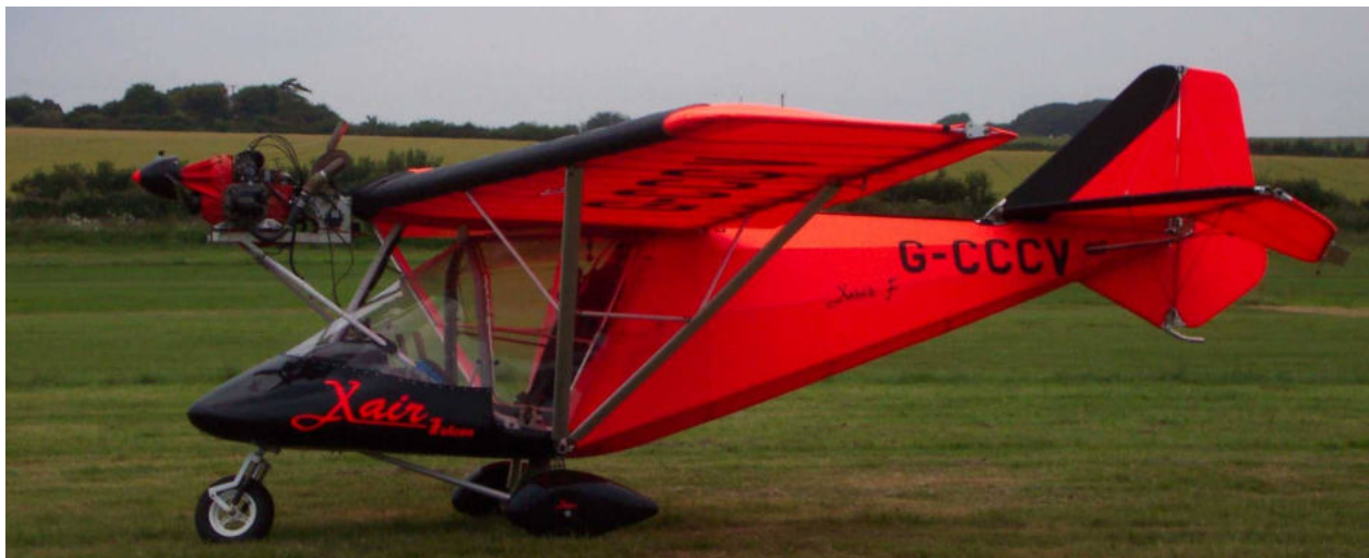
Figure 4 Raj Hamsa X'Air F (UK designation X'Air Mk.2 Falcon)

Sales of the X' Air (termed X' Air Mk.1 in much UK documentation) were brisk: several hundreds of aeroplanes and aeroplane kits have been sold globally, and numerous variants have been tested and certified – usually distinguished by a wide variety of 2 and 4 stroke powerplants 5 . However, there had been particular pressure in the French market to reduce wing area, necessitating the introduction of flaps (most countries using the 450kg microlight definition required a maximum stall speed V_{so} of 35kn CAS). This led to the introduction of the flapped X' Air F, marketed in the UK as the X' Air Falcon (Figure 4). Total production of X' Air and X' Air F models has exceeded 1300 kits, mostly sold to private owners outside of India, although some Indian operators exist including at least one police force. (A more recent X' Air Hanuman (X' Air Hawk in the UK) model is a largely unrelated design.)