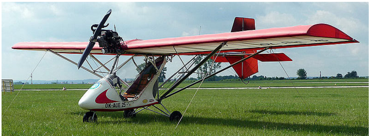
Figure 6 Letov Sluka

Globally, sales of both the Phantom and Sluka have been good; however, far more significant has been the development by Australian hang-glider designer Steve Cowan of the Thruster, which first flew in November 1982. In the early 1980s, the global 3-axis microlight market lacked a reliable 2-seat training aircraft. Training available in common light aeroplanes such as the C150 or PA28 families is very unrepresentative of these far lighter aeroplanes. This was solved by the introduction after several generations of development of the 2-seat Thruster TST Mk.1 (or Two Seat Trainer, known in Australia as the Gemini) about 1985, which despite being extremely crude, lacking doors, an internal engine starter or ground brakes, rapidly became a standard training aeroplane in the UK and Australia 6 . The Thruster TST had two seats and dual controls (a single stick between the seats, but duplicated throttles and rudder pedals). Performance allowed training from 250m semi-prepared runways, and it was cheap. These characteristics suited it well to this new training role.