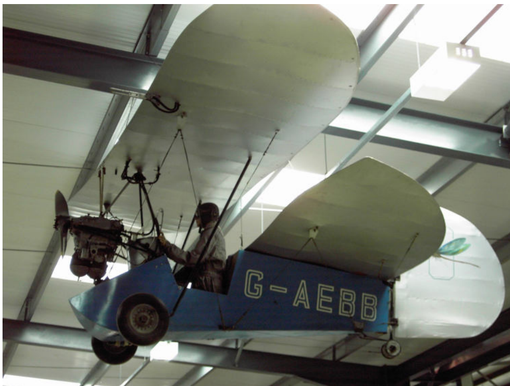
Figure 10, Mignet HM14 Pou du Ciel