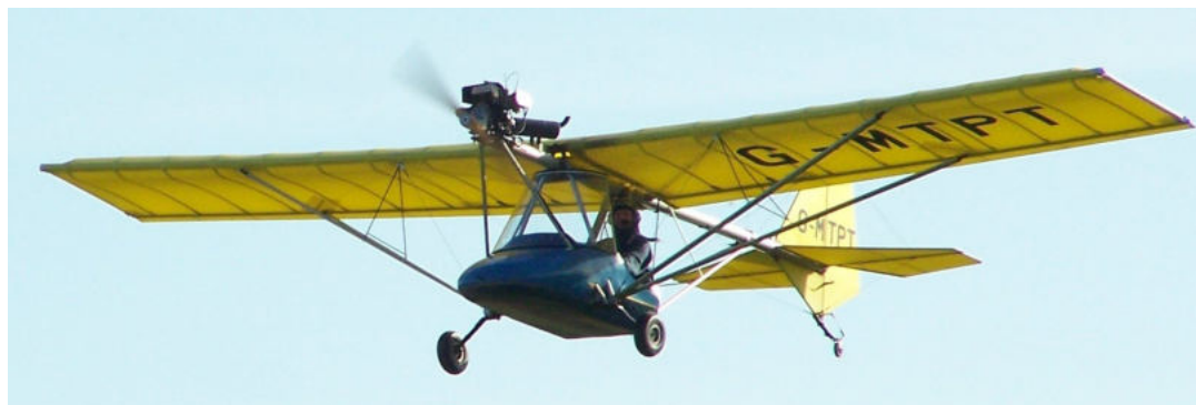
Figure 6 Thruster TST Mk.1

Development of the Thruster marque continued in parallel in Australia and the UK, where an independent manufacturer had acquired design rights. Via a slightly modified Thruster T300 boasting a larger engine, higher MTOW and more streamlined structure, the Thruster T600 was developed (Figure 7), which became available in either nosegear or tailwheel variants.