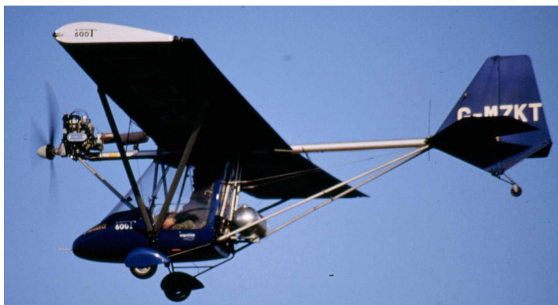
Figure 7 Thruster T600T

Development of the Thruster marque continued in parallel in Australia and the UK, where an independent manufacturer had acquired design rights. Via a slightly modified Thruster T300 boasting a larger engine, higher MTOW and more streamlined structure, the Thruster T600 was developed (Figure 7), which became available in either nosegear or tailwheel variants.